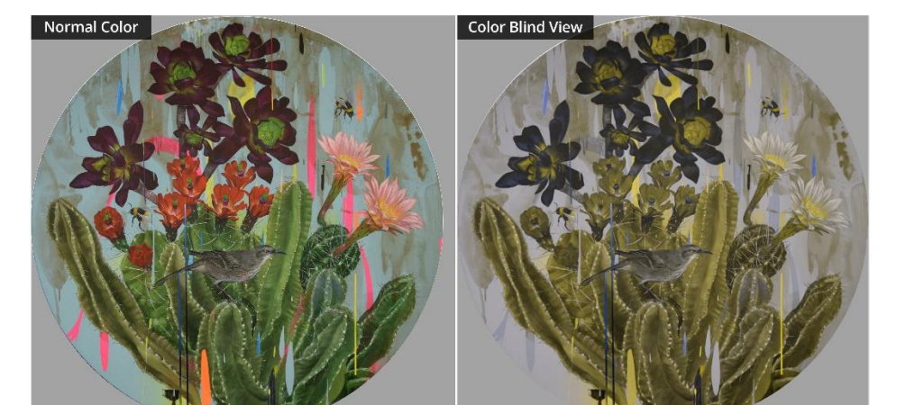
Frank Gonzales, Melodrama, acrylic on canvas. 2019.